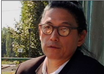
LI-YOUNG LEE China/Chicago, USA

After The Pyre Self Help for Fellow Refugees Immigrant Blues